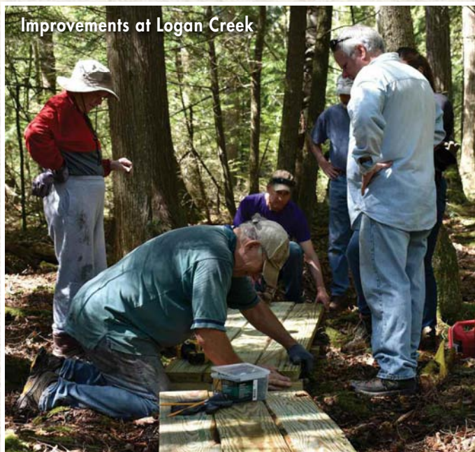
Improvements at Logan Creek