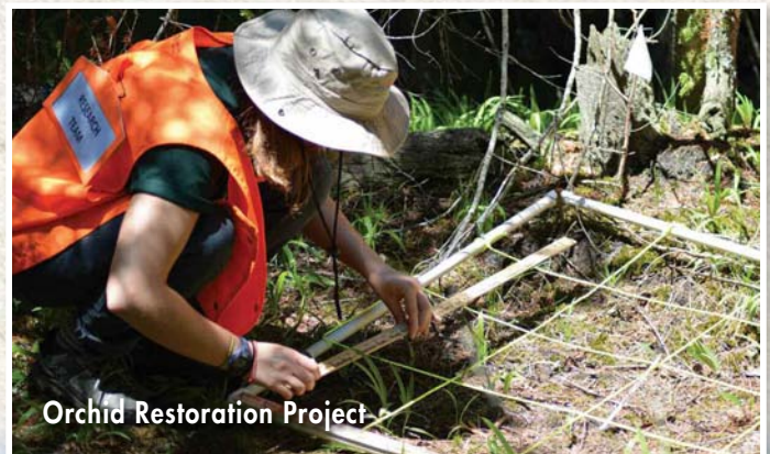
Orchid Restoration Project

Today over $15,000 is dedicated to research on an annual basis. Think of what we could accomplish if we had a research had a $1 million endowment that contributed $50,000 a year...forever?