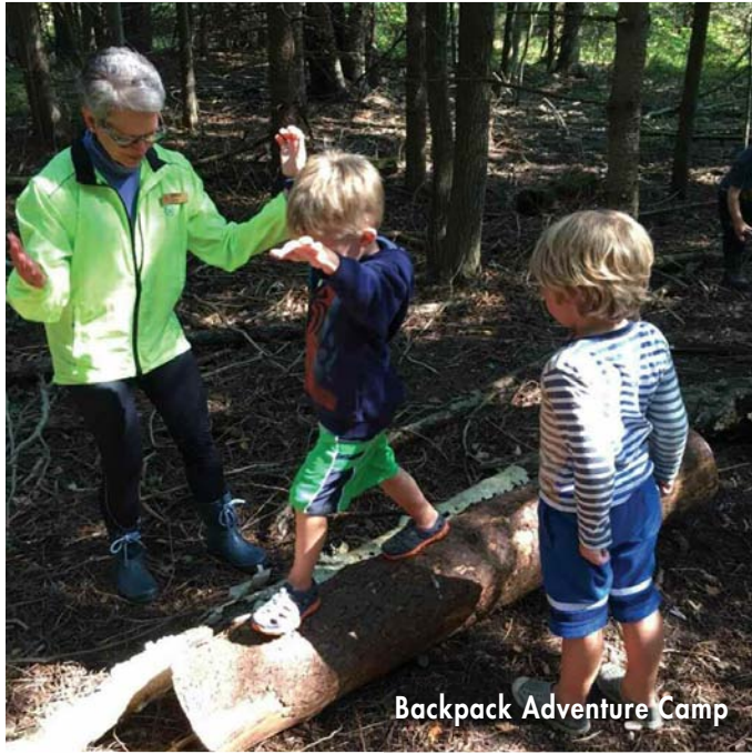
Backpack Adventure Camp

What can we accomplish together with passionate donors delivering on our mission?