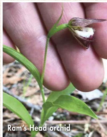
Ram's Head orchid