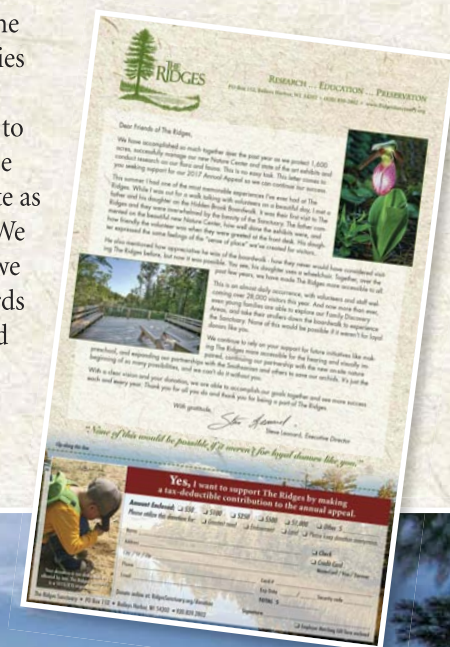
Albert Fuller-Cook Nature Center

The Ridges, like most other non-profits, conducts an Annual Appeal. This is the largest fundraiser for The Ridges and provides nearly half of all contributions for the year. It not only relies heavily on all who receive the mailing to donate but for those people to contribute as much as they can. We are confident that we are excellent stewards of the donation and can continue to grow because of it.