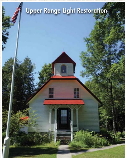
Upper Range Light Restoration

Designated or restricted contributions are utilized for specific initiatives. They are NOT to be used for anything outside of the scope of that project or initiative. It is important for the organization, as well as the donor, to understand this. For The Ridges, such initiatives include the "Restoring the Range Light" campaign for the Upper and Lower Range Light and the "Orchid Restoration Project", a nationally recognized research initiative to preserve our existing orchids and to restore those that have disappeared over the decades. This also includes our land fund, where contributions are set aside in preparation for future land acquisition.