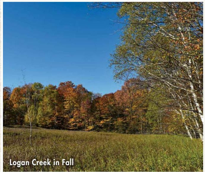
Logan Creek in Fall

Today, over $70,000 a year is dedicated to manage land we protect. An additional $35,000 has been contributed to a restricted fund for land purchasing. What if it doubled? What if we had $100,000 or even $500,000 in a restricted fund for future land acquisition?